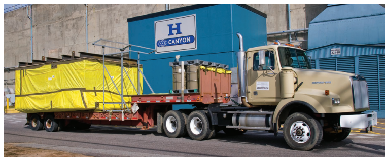
H Canyon transuranic waste activities