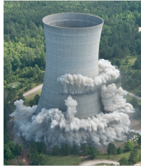
K Cooling Tower demolition