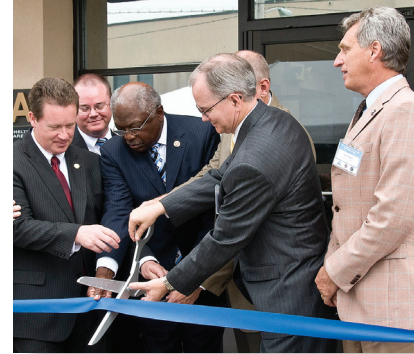
FBI Forensic Lab ribbon-cutting