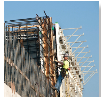
Waste Solidification Building

SRNS NNSA Programs is comprised of Tritium Programs (TP) and Nuclear Nonproliferation Programs (NNP). TP executed NNSA's tritium missions by extracting new tritium from irradiated target rods, delivering Limited Life Component Exchange (LLCE) products and Gas Transfer System (GTS) Surveillance data and recovering helium-3. NNP supported the NNSA Surplus Plutonium Disposition Program with construction of the Waste Solidification Building, support of the Mixed Oxide Fuel Fabrication Facility construction and preliminary design of the Pit Disassembly and Conversion Project.