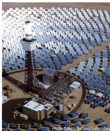
A Concentrating Solar Power (CSP) facility in Barstow, California