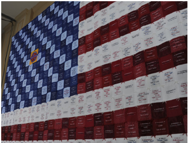
The National Day of Remembrance flag quilt was displayed at the event.