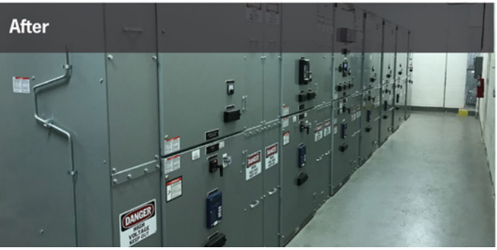
"Before and after" pictures of the K and L areas power distribution system project \,