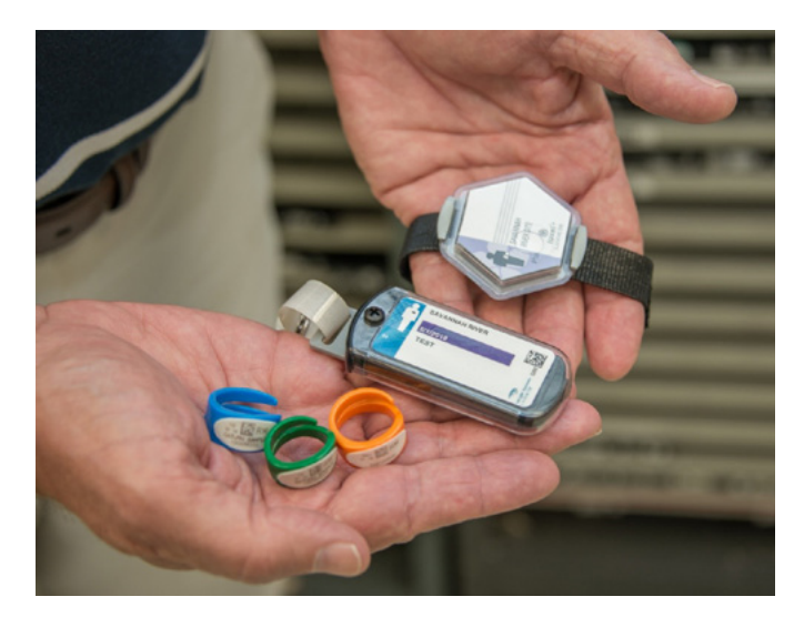
SRNS' new Landauer dosimetry equipment includes finger-rings and OSL dosimeters.

Since 2014, SRNS has hired approximately 48 graduates from Aiken Technical College's (ATC) RADCON program. In this program, students are taught the skills necessary for monitoring radiation and evaluating nuclear work sites. As a part of their coursework, students enrolled in this program are required to complete an internship experience at a DOE facility to obtain a working application of their studies.