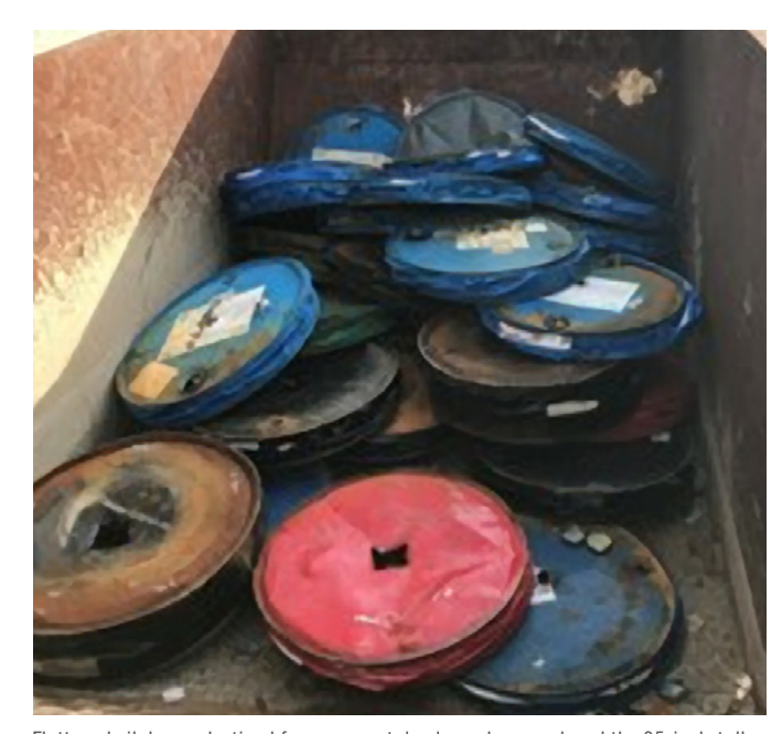
Flattened oil drums destined for scrap metal salvage have replaced the 35-inch-tall drums formerly sent to the Three Rivers Landfill.

"To date, SRNL has successfully transferred three capabilities from F/H Laboratory including the analysis of tank corrosion chemistry samples, processing of radioactive beryllium samples and rad asbestos monitoring equipment. These transfers yield cost savings and provide centralization of analytical methods, which better aligns laboratory resources for future needs," said Marra.