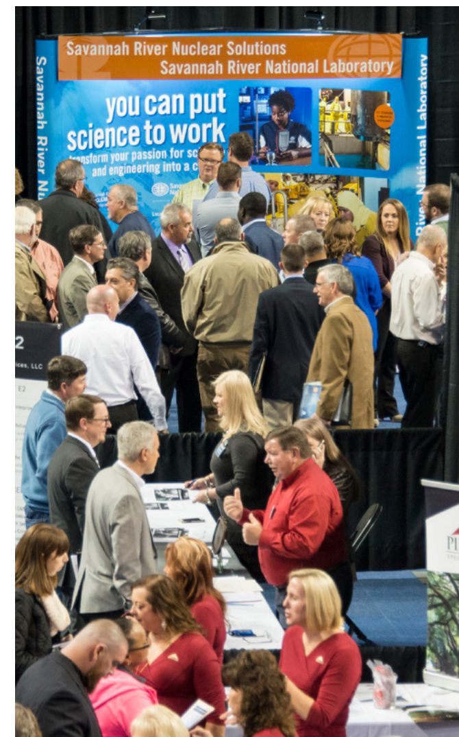
PHOTOS: More than 850 MOX Services employees packed the USC Aiken Convocation Center to learn about job openings at SRNS and 10 other entities.