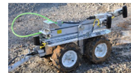
Robot used for the inspection of an H Canyon air tunnel

recently deployed robots to successfully inspect the SRS H Canyon Air exhaust tunnel. These inspections were necessary to validate the condition of the 60-year-old tunnel and ensure that it is safe for continued operations. Remote devices have also been used to inspect reactor tanks and to safely recover and contain contamination sources.