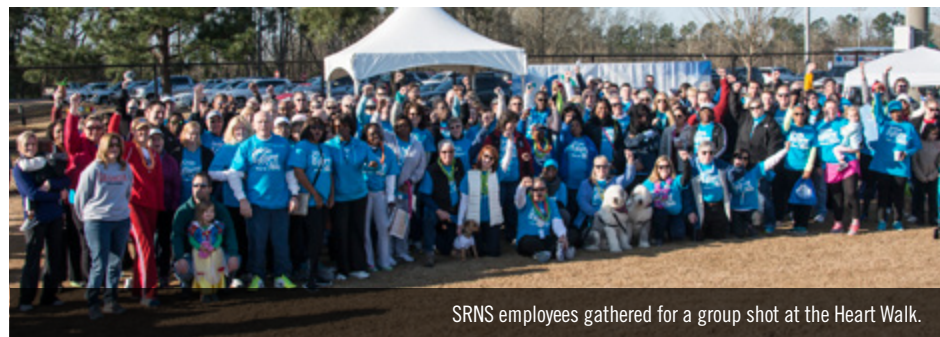
SRNS employees gathered for a group shot at the Heart Walk.

Proceeds from the CSRA Heart Walk will help fund the American Heart Association's life-saving initiatives, such as research for the treatment of cardiovascular disease and stroke, the number one and number five killers of men and women in the United States respectively.