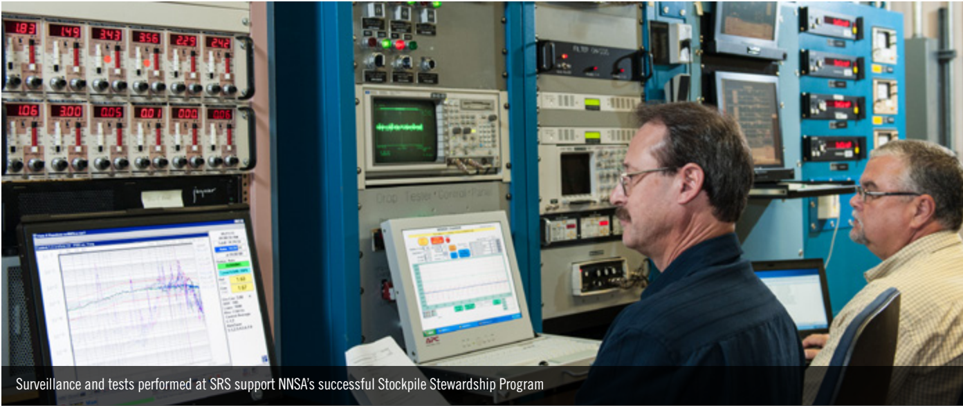
Surveillance and tests performed at SRS support NNSA's successful Stockpile Stewardship Program