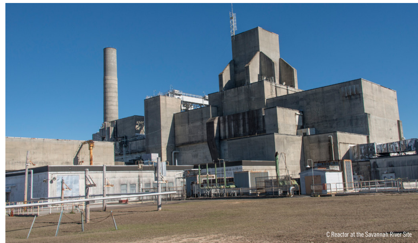
C Reactor at the Savannah River Site

"C Reactor's facility design information is contained within thousands of drawings that date back to the original building construction in the 1950s," said Bobbitt. "These drawings were organized in a way to aid in building construction and maintenance, but they are not the best way to address the facility's closure. To rely on this method alone would require the team to cross reference many drawings just to get a good picture of what exists in one room."