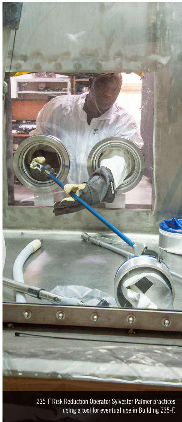
235-F Risk Reduction Operator Sylvester Palmer practices using a tool for eventual use in Building 235-F.

Several facilities in F Area at SRS have recently made significant progress in removing residual nuclear materials, which reduces risks to workers and the environment.