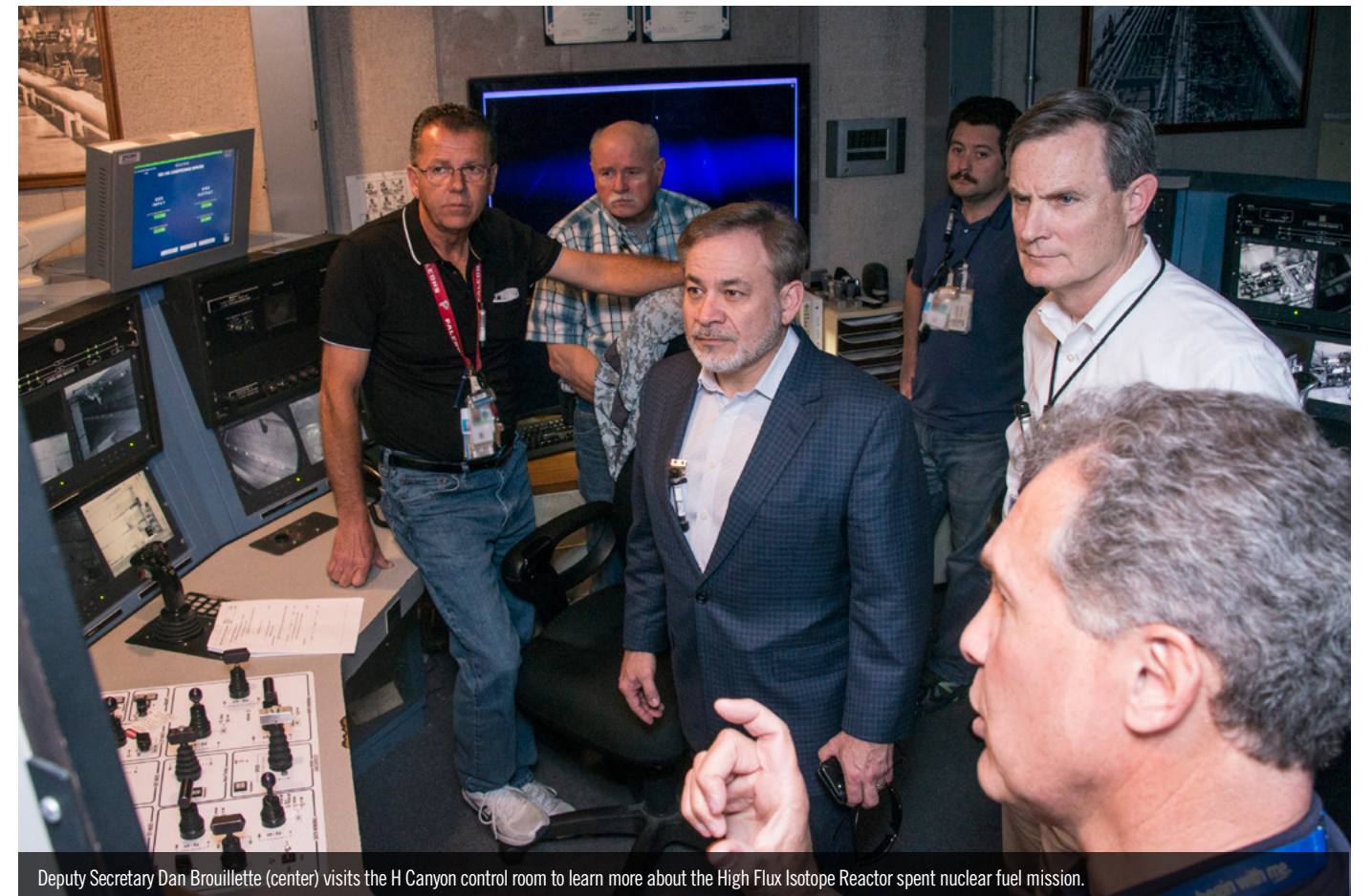
Deputy Secretary Dan Brouillette (center) visits the H Canyon control room to learn more about the High Flux Isotope Reactor spent nuclear fuel mission.