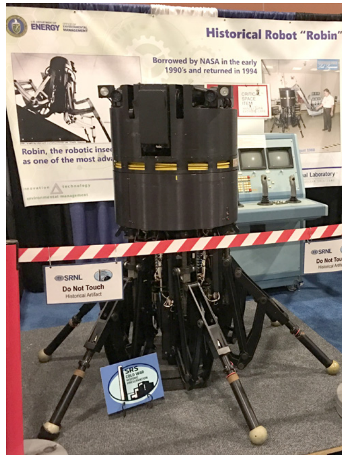
SRNL's historic Robin robot on display at Waste Management 2018

Members of the SRNL robotics team—known then as the Savannah River Lab Robotics group—worked with Robin over the years to develop techniques and procedures for use in emergency response and maintenance situations. Robin's high price tag saved it from use in actual radiation areas and dangerous missions where it could face contamination or damage. Experimentation with Robin provided the basis for many future robotic systems developed by SRNL for use at SRS.