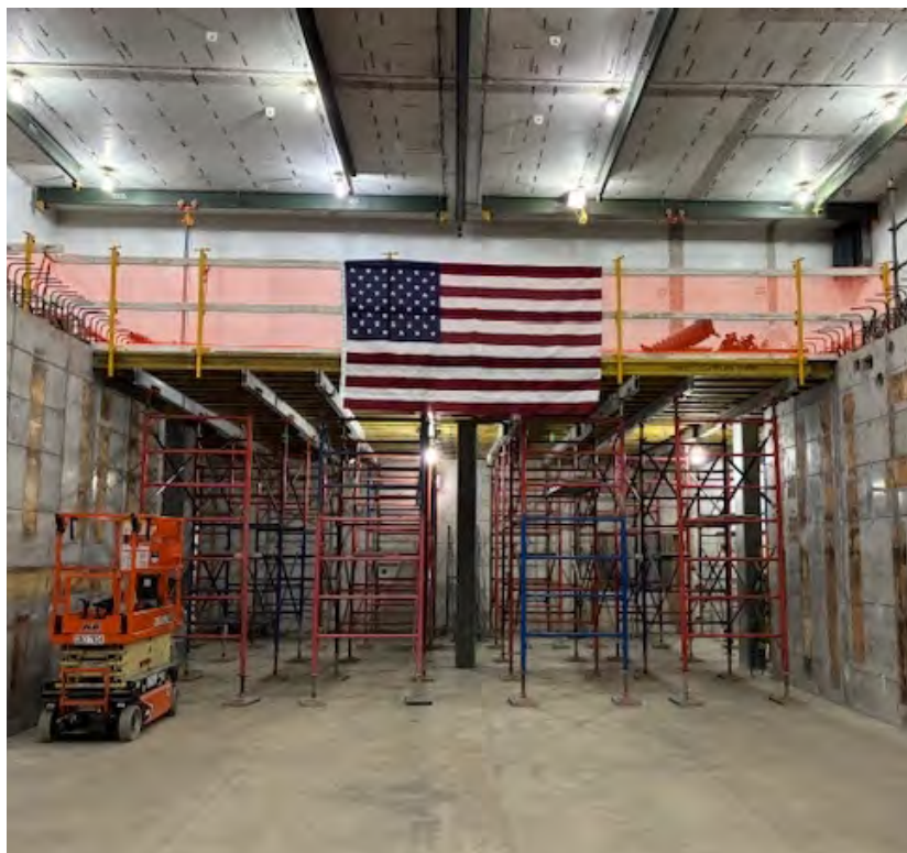
Four of 11 walls are complete with partial placements completed for two additional walls.

Under the new recovery mission, UNF is dissolved in nitric acid, and the uranium is recovered by removing impurities through solvent extraction cycle operations. The uranium is mixed with natural uranium to "blend down" the material to the desired enrichment, then shipped to a conversion facility to be made into fuel.