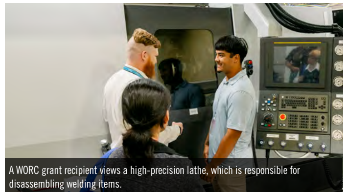
A WORC grant recipient views a high-precision lathe, which is responsible for disassembling welding items.