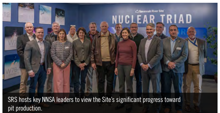
SRS hosts key NNSA leaders to view the Site's significant progress toward pit production.