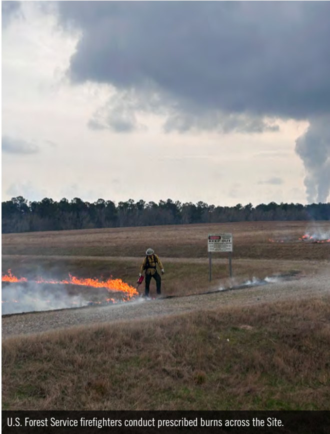
U.S. Forest Service firefighters conduct prescribed burns across the Site.

SRNS Area Completion Projects (ACP) and the U.S. Forest Service (USFS) are working together to conduct prescribed burns across 33 legacy waste sites at SRS. This renewed effort marks a return to a practice that involves meticulously planned controlled burns by the USFS to maintain the integrity of these protective structures.