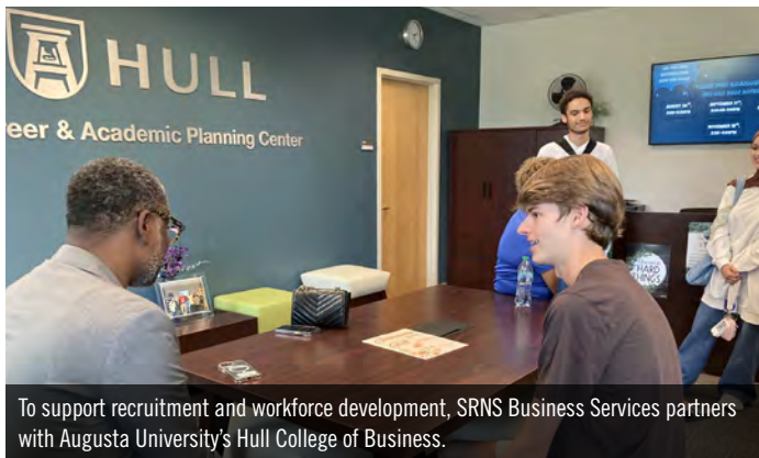
To support recruitment and workforce development, SRNS Business Services partners with Augusta University's Hull College of Business.

The Augusta University event engaged 125 students, reinforcing SRNS' commitment to preparing future talent for DOE and NNSA mission demands. SRNS has planned similar initiatives with institutions like South Carolina State University, Florida International University and the University of South Carolina Aiken in fiscal year 2026.